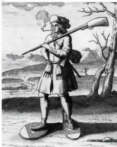
A Canadien on snowshoes in 1722, from an illustration in Histoire de l'Amérique septentrionale .

Boucher also addressed the subject of winter in what might be seen as a precocious FAQ, but subtitled using the rather longer phrase "Answers to questions that were made to the Author while he was in France." To the question of how cold winter really is, the author answered that some days are very harsh, but that this does not prevent anyone from doing what they have to do: They wear more