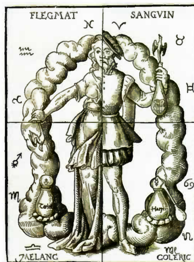
A 1574 woodcut of the four humours. An imbalance was thought to cause disease.

The expedition's most serious problem was scurvy. The legs of the afflicted grew inflamed, their sinews contracted and became black as coal, and they "had their mouths so tainted that the gums rotted away down to the roots of the teeth, which nearly all fell out." Cartier reported that by the middle of February fewer than 10 out of the original 110 were still in good health. The disease was unknown to Cartier —