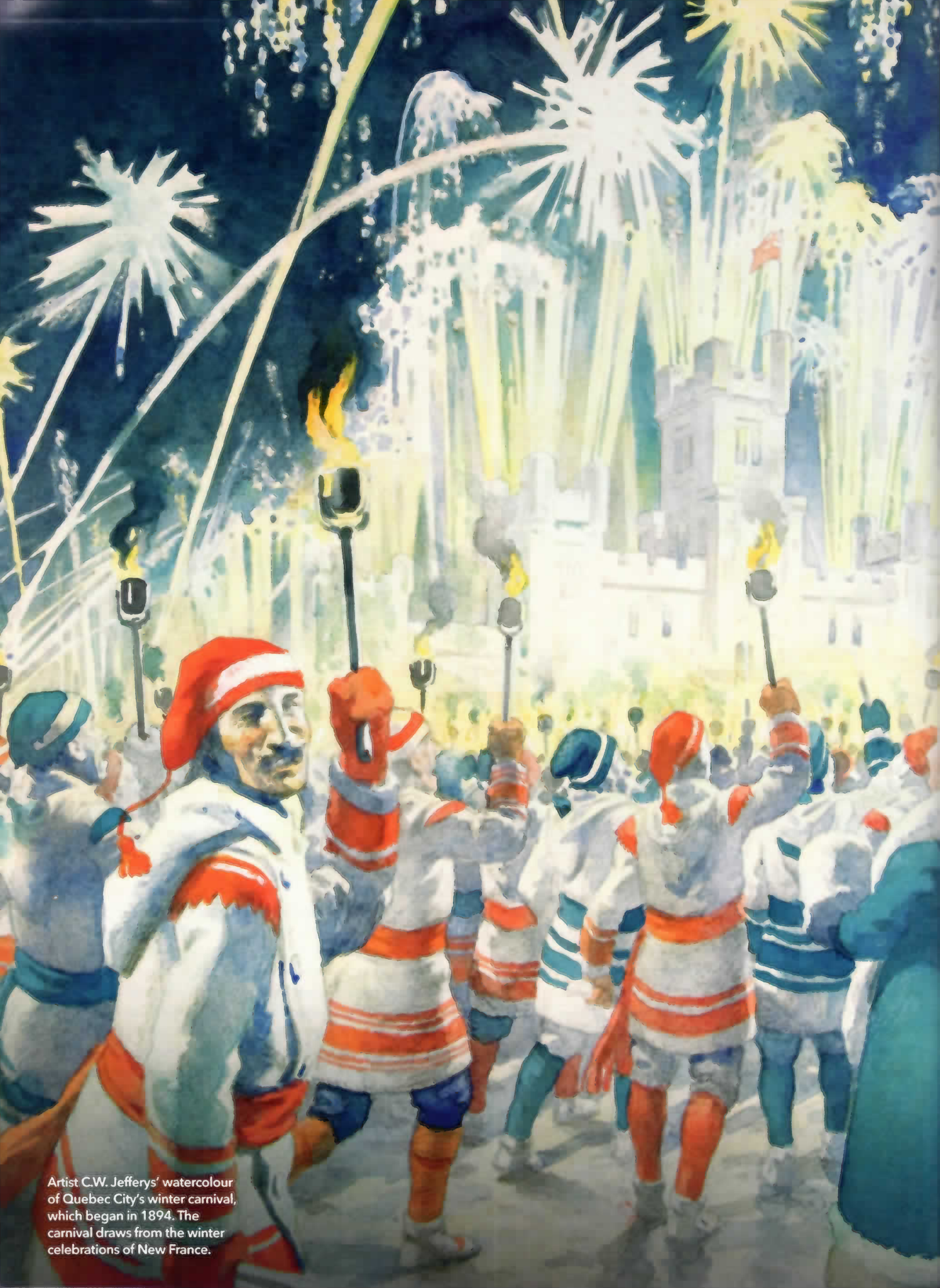
Artist C.W. Jefferys' watercolour of Quebec City's winter carnival, which began in 1894. The carnival draws from the winter celebrations of New France.