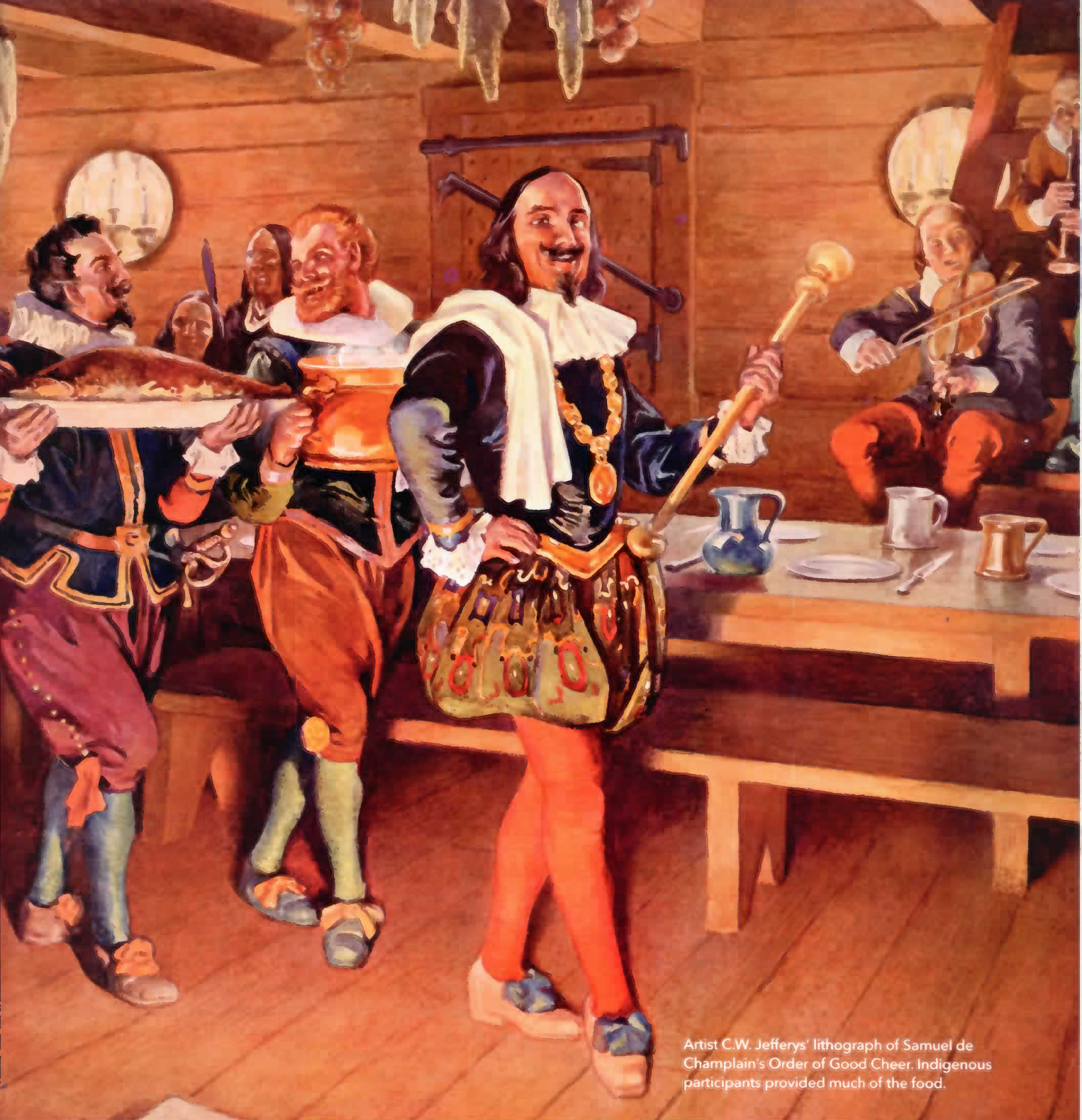
Artist C.W. Jefferys' lithograph of Samuel de Champlain's Order of Good Cheer. Indigenous participants provided much of the food.

as is clearly shown in the area of transportation. Champlain described how the Montagnais used snowshoes during their winter hunts, tracking moose and other animals through deep snow: "When they go hunting they make use of certain racquets, twice as large as those of our country, which they attach under their feet, and with these they travel over the snow without sinking."